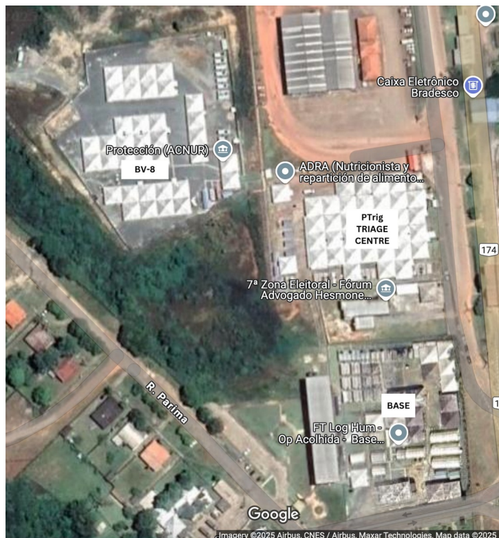
Figure 3: Aerial view of the army base, triage centre, and BV-8, Google Maps 2025.

The army base is located near the BV-8 transit centre and the two sites are separated by the triage centre, as pictured in figure 4. Military, government, and humanitarian personnel may access the army base for accommodation, offices, and storage supply. Despite their close proximity and similarities in design (including large tents, uniform layout, fenced perimeter), the spatialities of these two sites are strikingly different from one another. When I arrived at the army base, I noticed a man in uniform mowing the green, well-maintained lawn. The large tents I visited were mostly for storing supplies from humanitarian agencies. For accommodation, there were neat rows of small dwellings constructed from repurposed shipping containers. I walked through the rows, observing colourful pot plants placed out the front doors and air-conditioning units fitted to the sides. As I noted in my field diary, the army base felt ‘semi-suburban’. Unlike BV-8, there was a sense of comfort in the design, rather than sterility.