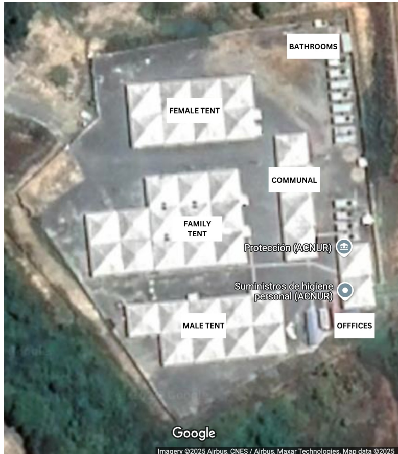
Figure 1: Aerial view of BV-8 centre, Google Maps 2025.

In BV-8, there are three large tents that each accommodate over 300 people. They are divided between men, women, and families. Single mattresses are available for use on the wooden floors, or in some cases, on metal bunk beds. Clearly marked Operation Welcome signs are posted throughout BV-8, signalling each area's designed purpose. This includes a covered communal space in the centre, where meals are served and people can gather. There are three meals provided per day, and there is access to bathrooms, laundry sinks, and medical care (Presidência da República: Casa Civil n.d.).