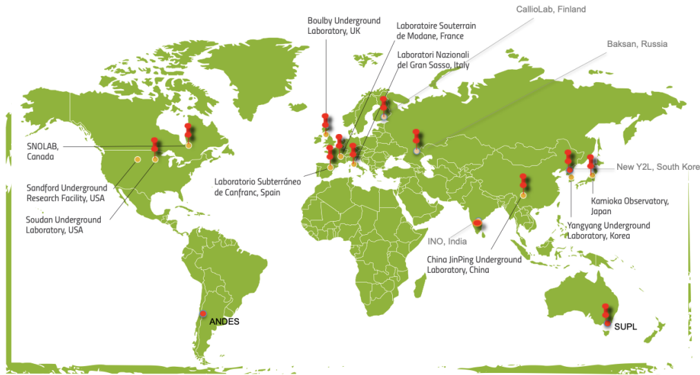
Figure 1: Deep underground laboratories around the world. Red thumbtacks correspond to underground laboratories discussed in this paper. Dots correspond to other laboratories and proposed projects.

Underground laboratories have many common features and at the same time they also have different specific characteristics (e.g. varying depths, geological compositions, laboratory sizes, access capabilities and support services provided) that make them more or less suitable for specific activities. For example, Boulby in the UK has surrounding geology that results in a particularly low ambient radon level underground; Canfranc in Spain and CallioLab in Finland have access to sites at different depths allowing studies with a different muons background level; JingPing in China and SNOLab in Canada are very deep with a significant reduction of the locally muon-induced background.