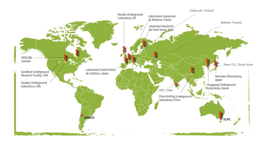
Figure 1: Deep underground laboratories around the world.

volume and the muon flux are reported in figures 2 and 3, respectively. The total excavated volume is of the order of 1.5 \times 10^6 m<sup>3</sup>. The muon flux changes depending on the surface landscape: under a mountain the flux can have a strong dependence on zenith and azimuth angles. Figure 3 shows the difference of effective depth for a flat surface or a mountain profile.