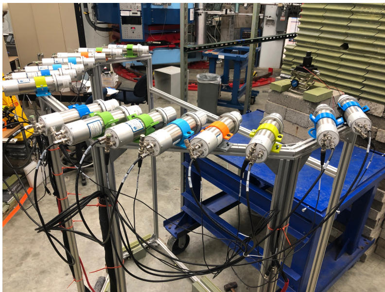
Figure 1: Experimental setup at TUNL

96 The experimental setup for the measurement is as shown in Figure 1. 15 scintillating 97 “backing” detectors (BD) consisting of EJ-309 liquid scintillation cells were deployed for the 98 current run to tag the scattered neutrons off the Na or I nuclei. Each of the BDs was equipped 99 with a lead shielding cap in front of their enclosure during operation to reduce the background 100 gamma trigger rate. Further, an additional backing detector was employed as a time-of-flight 101 detector in order to measure and monitor the spread of the neutron beam energy.