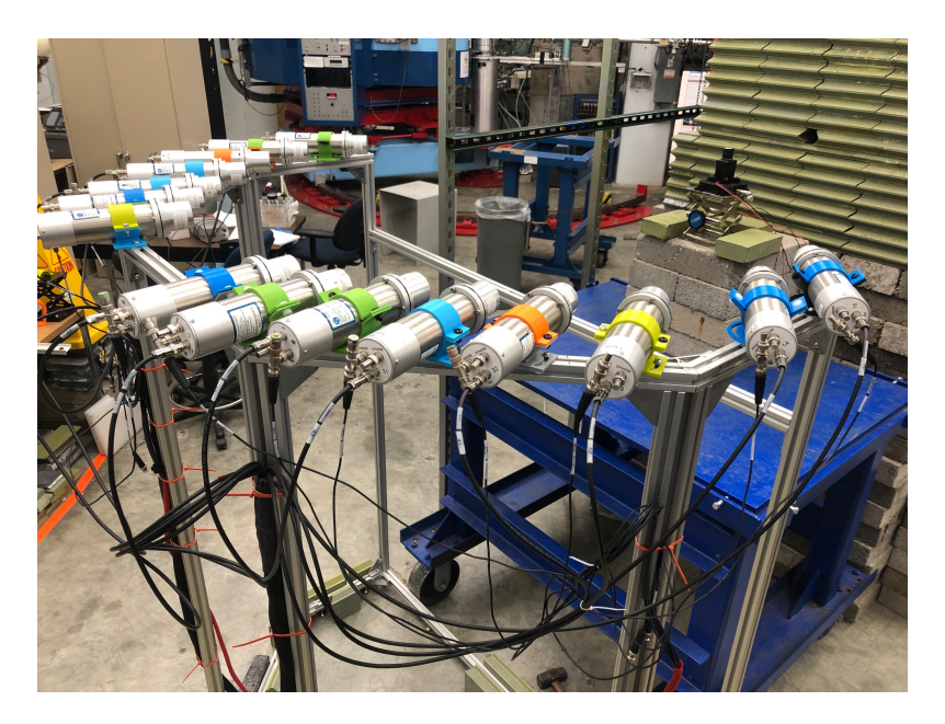
Figure 1: Experimental setup at TUNL

The experimental setup for the measurement is as shown in Figure 1. 15 scintillating "backing" detectors (BD) consisting of EJ-309 liquid scintillation cells were deployed for the current run to tag the scattered neutrons off the Na or I nuclei. Each of the BDs was equipped with a lead shielding cap in front of their enclosure during operation to reduce the background gamma trigger rate. Further, an additional backing detector was employed as a time-of-flight detector in order to measure and monitor the spread of the neutron beam energy.