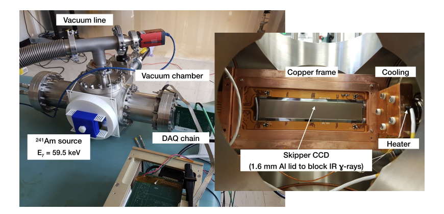
Figure 1: Experimental setup during the Compton data taking. The blue box fixed on the flange of the vacuum chamber contains the ^{241} Am source with Al plate blocking low energy \gamma -rays.

binning sums the charge of 4×4 pixels (columns × rows) before the charge readout. This combination and further analysis lead to the energy threshold E_{th} =23 eV (~6 e<sup>-</sup>).