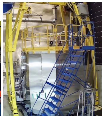
Figure 2: Left: The 140 cm in diameter NEWS-G spherical proportional counter being installed in SNOLAB. Right: The detector's shielding. The shield is comprises 3 cm archeological lead, 22 cm low activity lead, and 40 cm high-density polyethylene, encased in a stainless steel skin.

2022, and will define the electroforming parameters for ECuME.